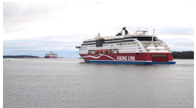
The Viking Line shipping company has two vessels in traffic between Åbo and Stockholm. They leave from opposite sides and meet in Mariehamn every afternoon. The vessels running the Helsinki-Stockholm and Stockholm-Tallinn routes also dock daily in Mariehamn. They have considerable height capacity but are also floating entertainment palaces with restaurants, nightclubs and duty-free shops.

Another issue for the new government is the effects of the tax border surrounding Åland. When Finland and Åland joined the EU in 1995, Åland negotiated a special status that included staying outside the EU's tax union. This was considered important to safeguard duty-free trade on the ships that call at Åland when in traffic between Finland and Sweden.