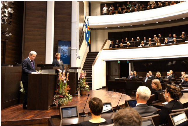
President Sauli Niinistö speaks at the opening of Åland's 2023–2024 parliamentary period in Mariehamn on 3 November 2023.

for Åland! It is very disappointing that no result has yet been reached here.