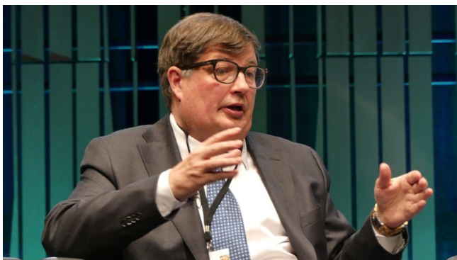
Finland's Minister of Employment Arto Satonen.

“But I believe that training people is the least of our problems. The labour shortage is a much bigger challenge, at least in Finland,” said Vieltojärvi.