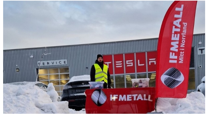
One of IF Metall's strike guards in front of one of Tesla's workshops.

Critics say collective agreements are cumbersome and time-consuming because of things like MBL – the Swedish Co-Determination in the Workplace Act. Companies like Tesla want to decide workplace conditions themselves instead.